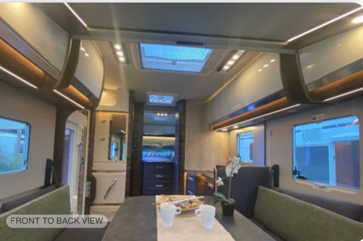
FRONT TO BACK VIEW