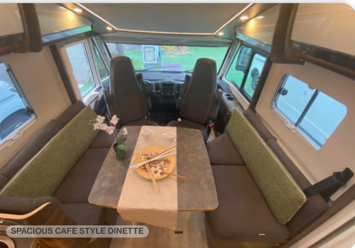
SPACIOUS CAFE STYLE DINETTE

Ecovip mobilehome – the historical series has been the loyal companion of many families since 1992: unforgettable experiences for lovers of adventure and anyone who wants to travel in comfort and style. Italian design and aesthetics combined with technical details and the highest quality ensure that you always feel at home.