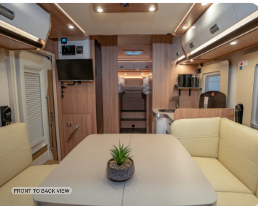
FRONT TO BACK VIEW

The Kosmo series is designed for families and couples looking for a comfortable and versatile camper. It is ideal for everyone who loves the outdoor lifestyle and for those who want to experience new adventures.