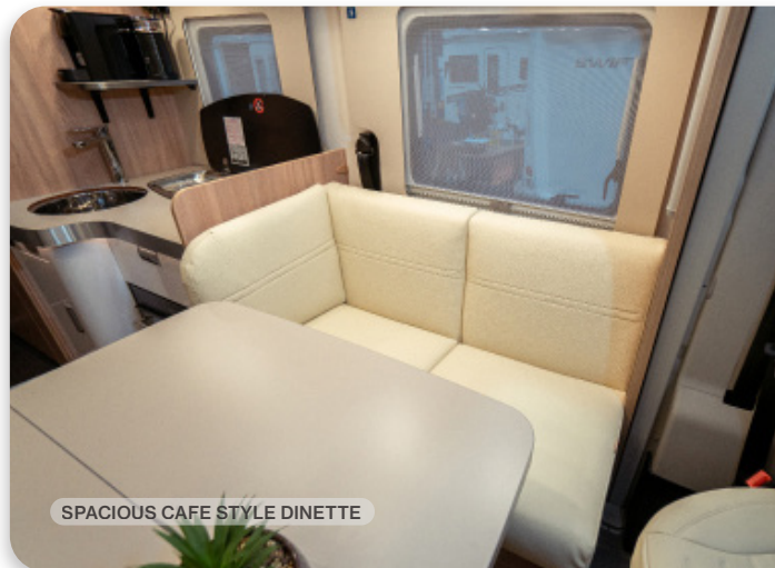
SPACIOUS CAFE STYLE DINETTE

* Interior colours subject to availability